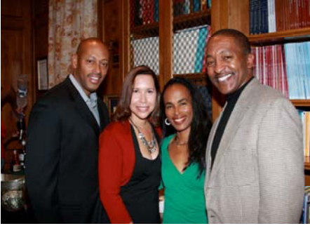
Pictured left to right: