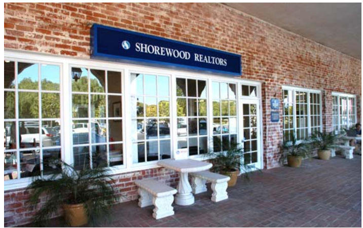
Wireless Internet Access "Hot Spot" in Malaga Cove Plaza

when everything you need is in Malaga Cove Plaza. Don your shoes and walk to Malaga Cove Plaza where you too can access the internet. Thanks to Shorewood Realtors, we all have easy access to the super highway. Pick up a croissant from the Ranch Market and a coffee from Chez Allez, as you make your way to numerous outside tables in front of Shorewood Realtors, where a free wi fi system is at your finger tips.