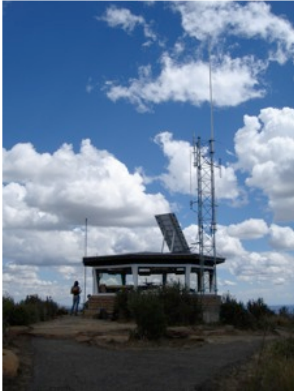
This antenna is at a fire lookout station in Mesa Verde National Park, Colorado around four-corners.