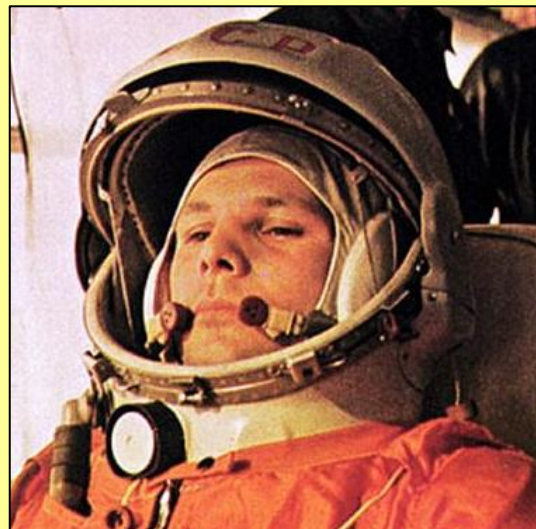
Cosmonaut Yuri Gagarin, the first human in space and to orbit the Earth.

The ARISSat-1 that will operate in his honor will do so with a CW beacon and on FM phone using the call sign RS01S. There will be both SSTV video (transmitted as FM audio) in Robot-36 format and 24 different voice greetings, mostly of children, but with a special one from Yuri Gagarin. These will be broadcast in 15 different languages. Article continued on next page ►