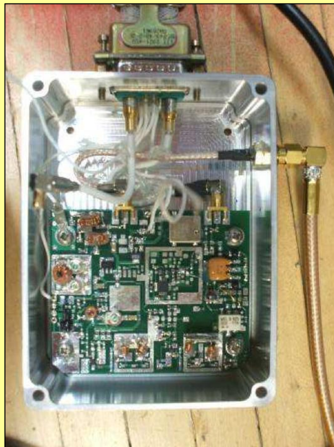
The transceiver unit in the ARISS-1 amateur satellite is about the size of a Starbucks® Venti cup.

Information and photographs courtesy of AMSAT, the Radio Amateur Satellite Corporation.