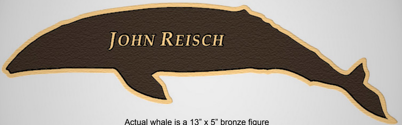
Actual whale is a 13" x 5" bronze figure

Please make your check payable to: City of Rancho Palos Verdes