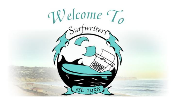
See you on February 24.

"Most people are on some kind of pilgrimage, whether or not they recognize it as such. If you put your writing in the form of a quest you will make a connection with your readers that will surprise you with its power." -William Zinsser